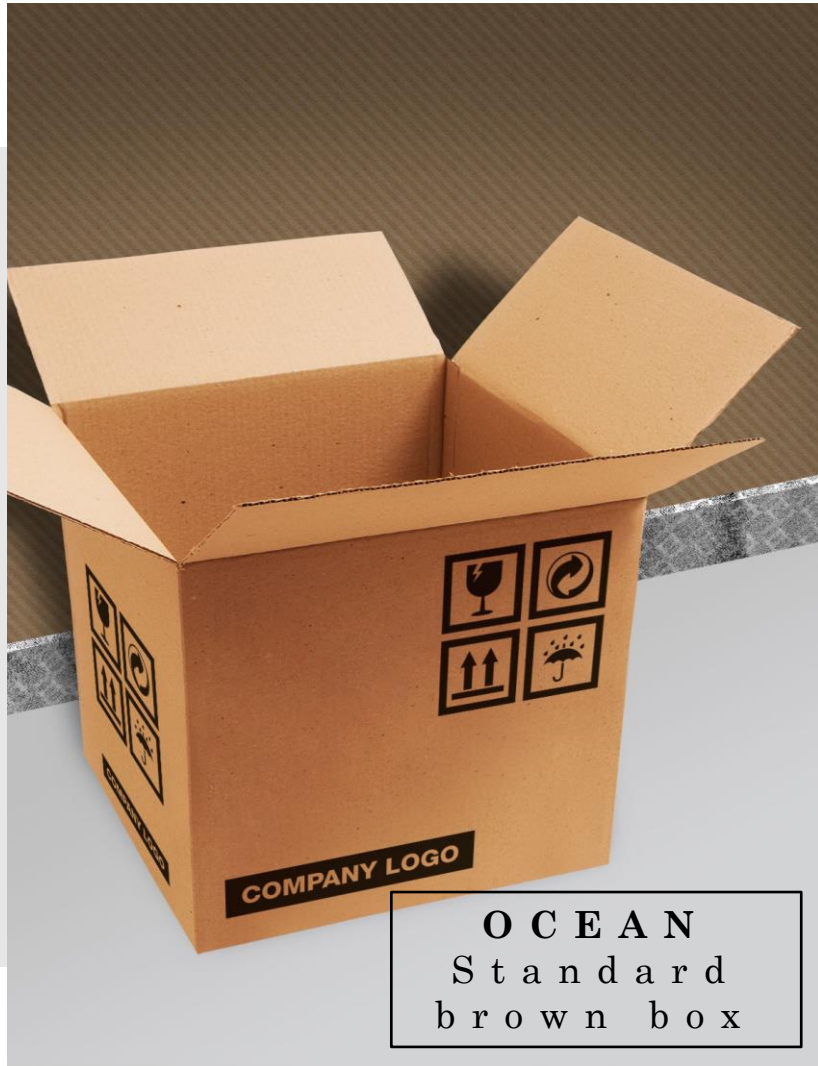
O C E A N S t a n d a r d b r o w n b o x